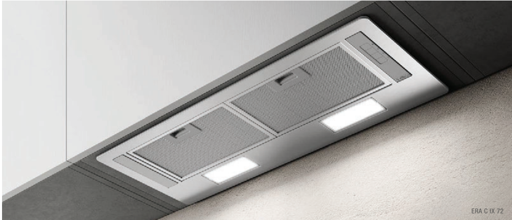
ERA C IX 72