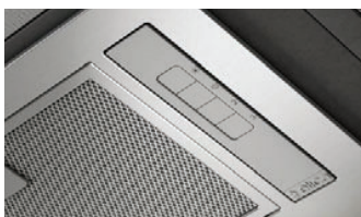
ERA C WH 52