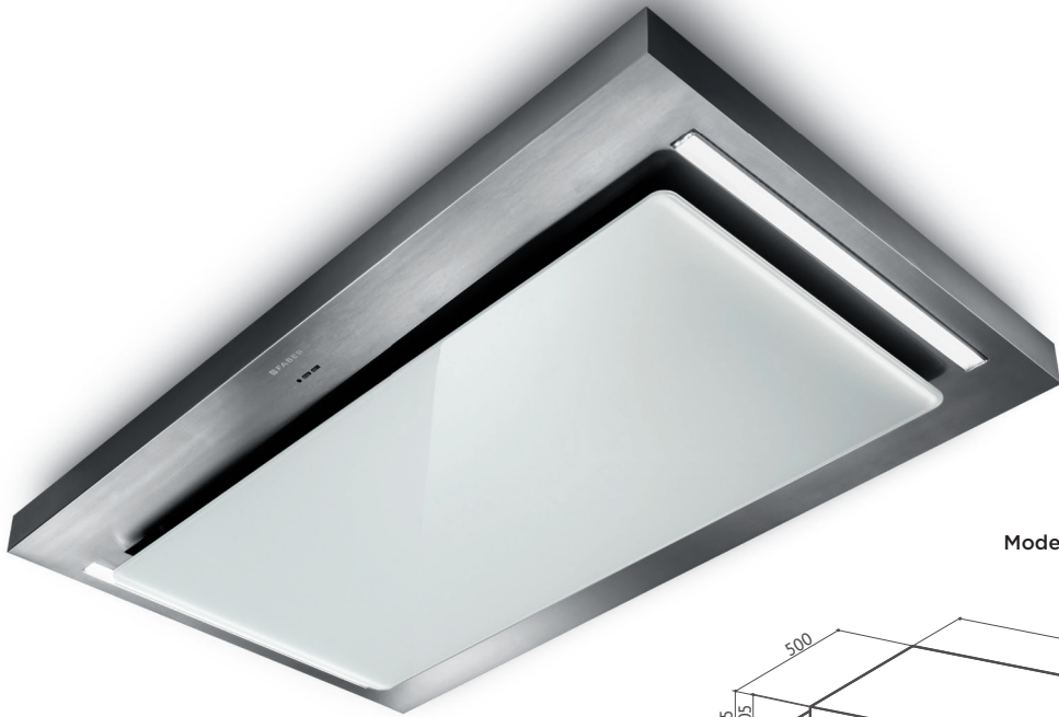
Model not built-in into the ceiling